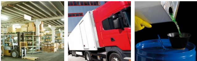
* The B-EX4T2 was benchmarked against competitor products in stand-by mode.