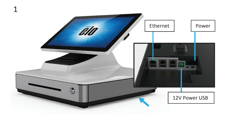
Connect power and ethernet cable. Connections are underneath the register near the back.