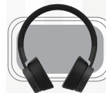
Lenovo Yoga ANC Headphone Black